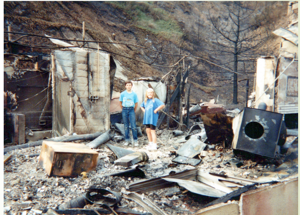
October 27, 1993 – Kinneloa Wildfire